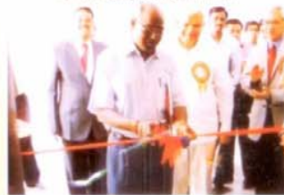
Inauguration of Scientific Session