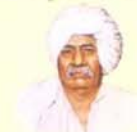
Padmashri Dr. Vitthalrao Vikhe Patil 1901-1980