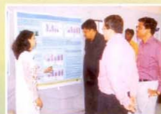
Scientific Poster at Glance