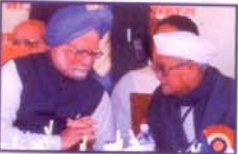
Hon'ble Shri Balasaheb Vikhe Patil, M.P. with Hon'ble Dr. Manmohan Singh, Prime Minister of India