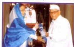
Hon'ble Shri Balasaheb Vikhe Patil received Padmabhushan by Hon'ble President Pratibha Patil